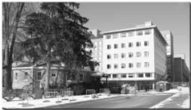
The recently opened extension to the MacKinnon Building looks over the old Bull Ring.