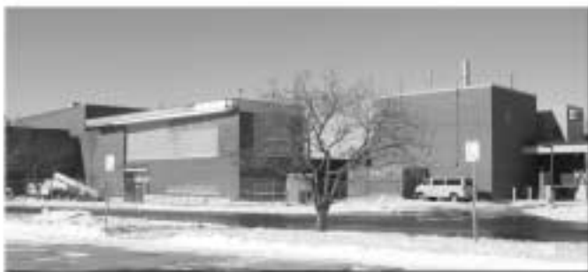
On the right, the Canadian Research Institute for Food Safety Building and on the left, the OVC Clinical Research Building located on McGilvary Street.