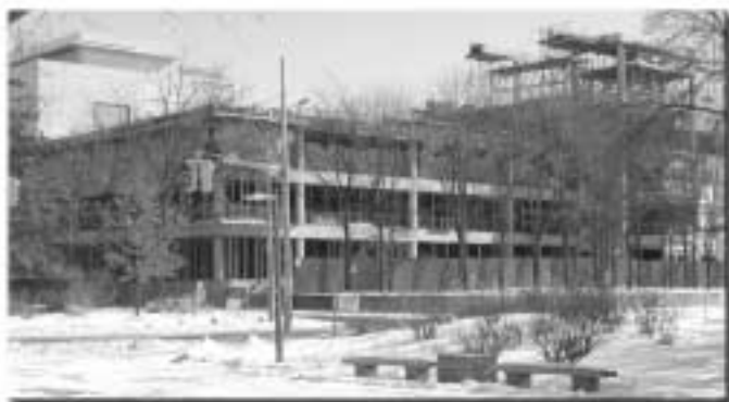
The addition to the new Science Building is located on Gordon Street.